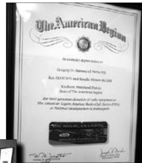
Above: A plaque on the wall of the "Radio Shack" thanks members of the S.A.L.